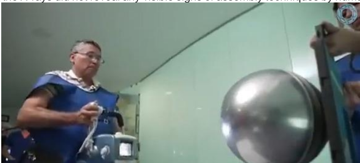
The mysterious object also had text written on one of its sides

They think that these may have been placed inside before the object was sealed. But the X-rays did not reveal any visible signs of assembly techniques by humans.