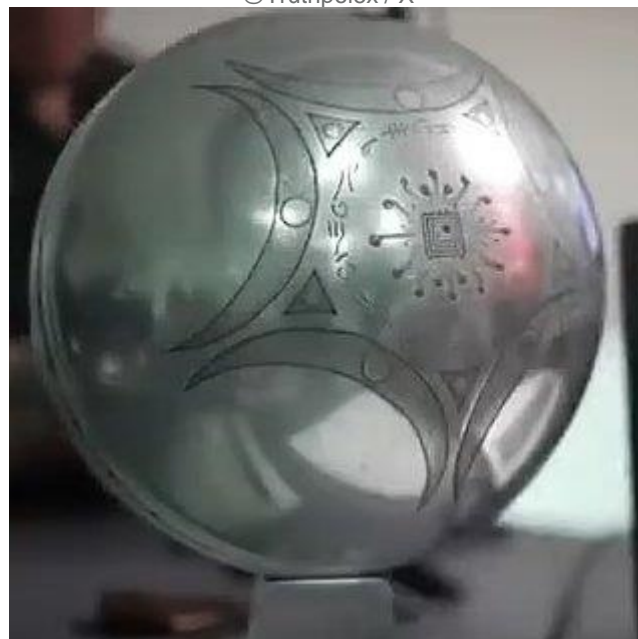
It was discovered in a forest in Buga, Colombia

One of the individuals who recovered the object David Velez el Potro said that the object was authentic, and claimed to have found it in the woods in Buga.