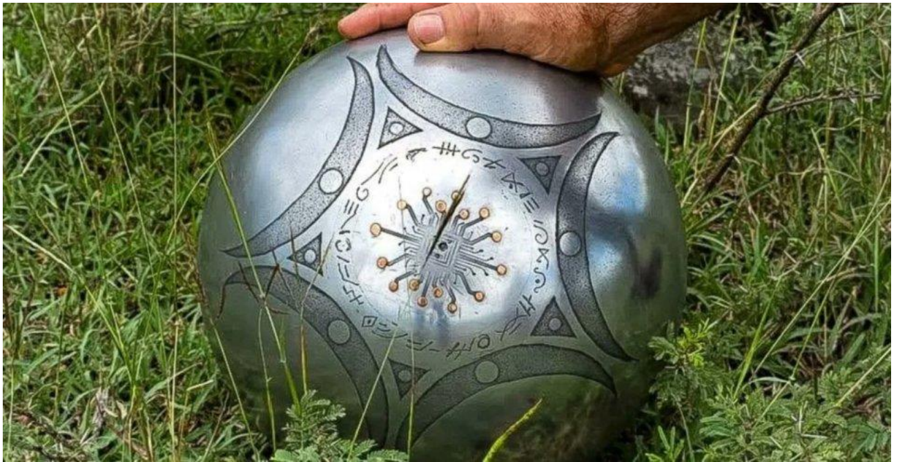
Boffins are researching a mysterious UFO orb